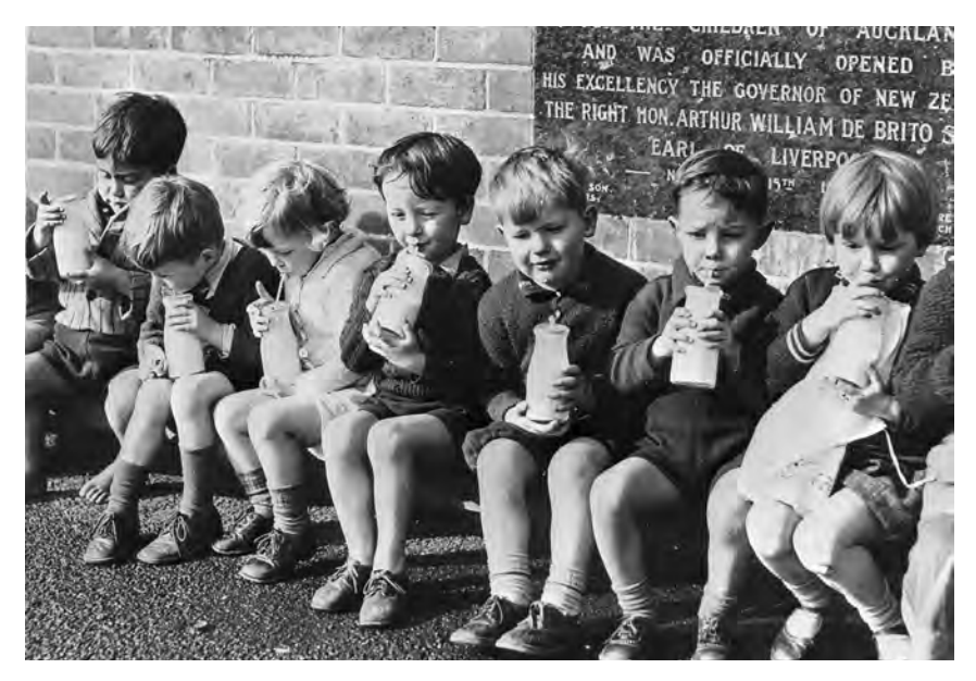
State subscription to biological models in health and education came together in the school milk programme begun in 1937, which ensured a daily boost of nutrition to all New Zealand primary school children.