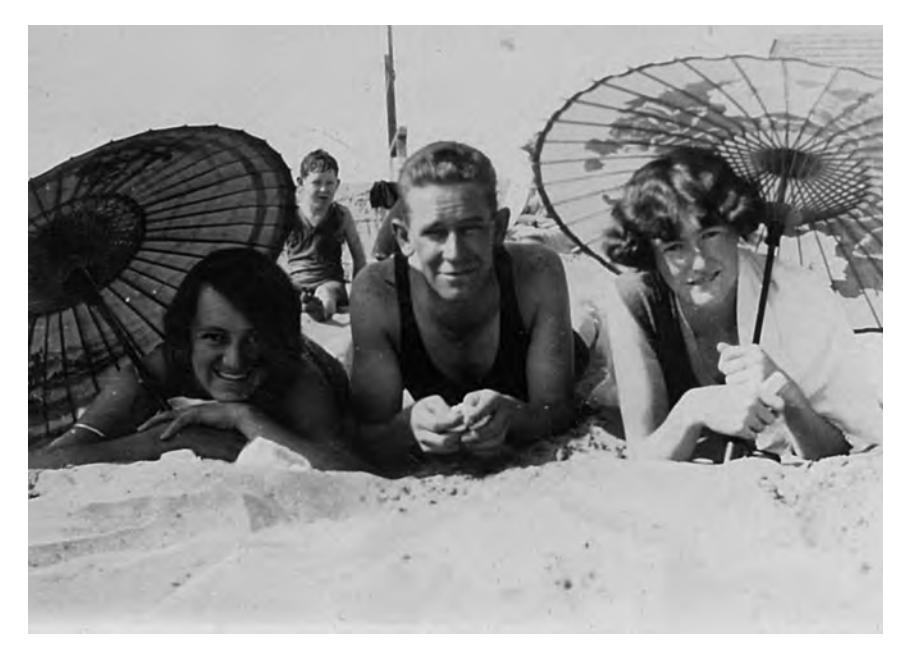
Changes in work patterns and increased mobility led to new leisure opportunities in the interwar period.