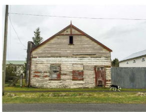
Kaitiaki Billboards Station, 2017