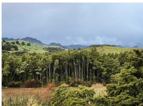
Whakapapa River, my view, 2019