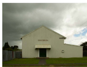
Kaitiaki Town Hall, 2018